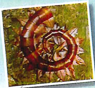
Leaves polished and greased, pinned to the ground with thorns.

Why don't you try making one next time you visit the coast?